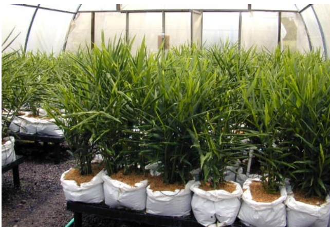
Figure 4. Ginger plants 5–6 months old; the bags will be unrolled as the plants receive one or two more hillings.