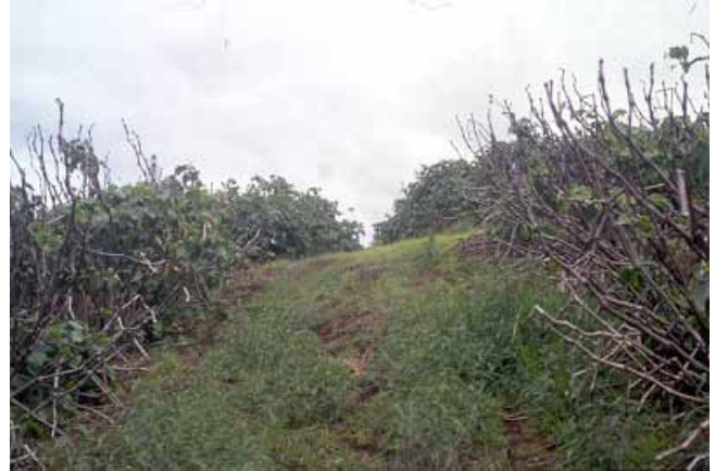
Massive defoliation of 'awa plants in a monoculture on the Hāmākua Coast of the island of Hawai'i